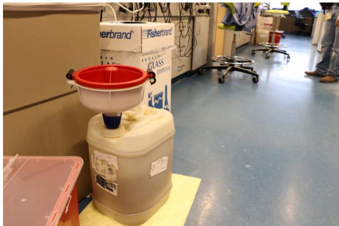
Don't let your lab waste sit around over the holidays!

There will be NO WASTE PICK-UP the following week (week of Dec. 28). Any pick-up requests not submitted in time for the pick-up on the 23rd will be delayed until after the new year, with the next scheduled pick-up on Thursday, Jan. 7 .